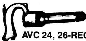
AVC 24, 26-REC

.401 1/8" 1/8" 1-7/8" 6" 2-3/4" .401 5/32" 5/32" 2-1/2" 6-3/4" 3" .401 3/16" 3/16" 3" 7-3/4" 3-1/4" .401 1/4" 1/4" 4" 8-3/4" 3-1/2"