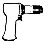
AVC10-REC AVC11-REC AVC12-REC AVC13-REC

.401 1/8" 1/8" 1-7/8" 6" 2-3/4" .401 5/32" 5/32" 2-1/2" 6-3/4" 3" .401 3/16" 3/16" 3" 7-3/4" 3-1/4" .401 1/4" 1/4" 4" 8-3/4" 3-1/2"