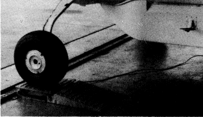
SKYMASTER ON 2,000 POUND WHEEL WEIGHERS

WHEEL WEIGHERS...FOR SMALL AIRCRAFT to check small aircraft weight and balance after fitting of new accessories or modifications. Flight safety is improved by periodic weighing.